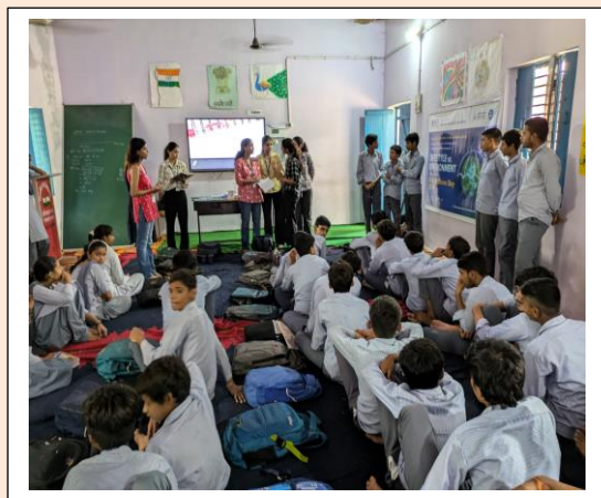
Prize distribution after Quiz competition