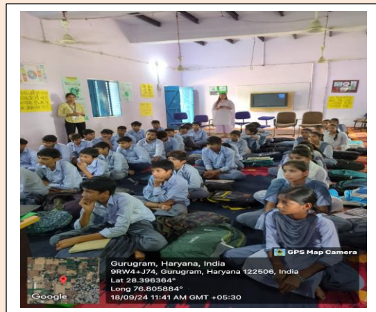
Awareness session and knowledge exchange