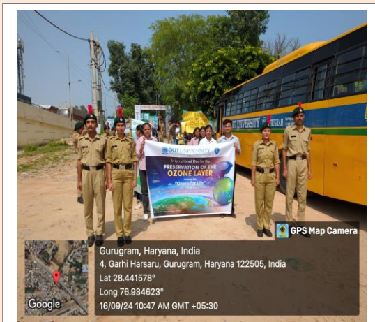
NCC & NSS Units have also joined in the awareness rally