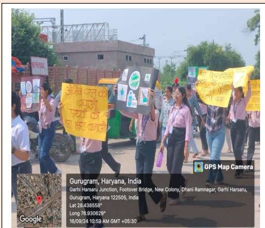
Chanting slogans for saving ozone layer