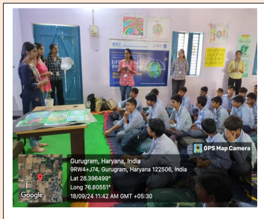
M.Sc, EVS Students interacting with school students