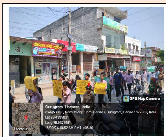
Showcasing the issues of ozone later depletion